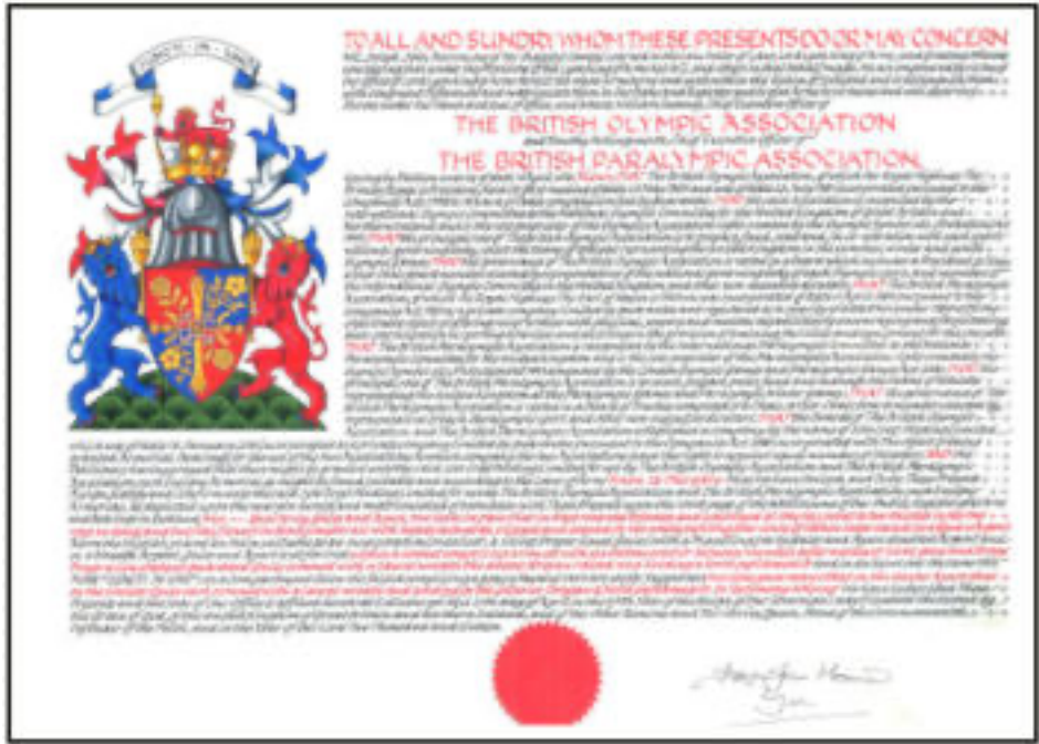
An example of a grant An example of a matriculation