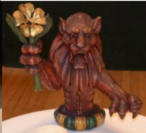
Crest of the Earl of Roseberry