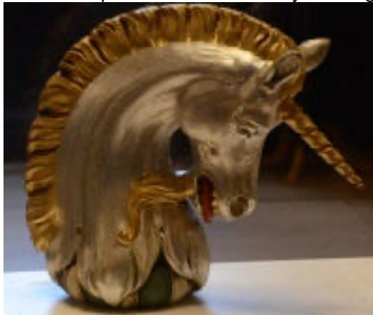
Crest of the Duke of Roxburgh

These are the Chief's relatives, including his own immediate family and even his eldest son, and all members of the extended family called the "Clan", whether bearing the Clan surname or that of one of its septs; that is all those who profess allegiance to that Chief and wish to demonstrate their association with the Clan. It is correct for these people to wear their Chief's Crest encircled with a strap and buckle bearing their Chief's Motto or Slogan. The strap and buckle is the sign of the clansman, and he demonstrates his membership of his Chief's Clan by wearing his Chief's Crest within it.